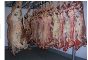
Chilling/aging process Antimicrobial mist and Ambient Air application