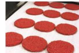
CIP of Conveyor systems & Patty Forming Press applications