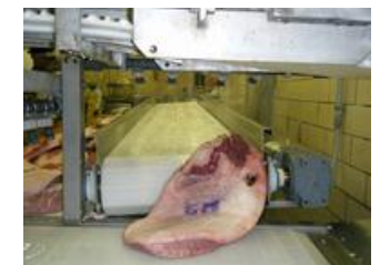
Sub-primal Antimicrobial spray bar wash application