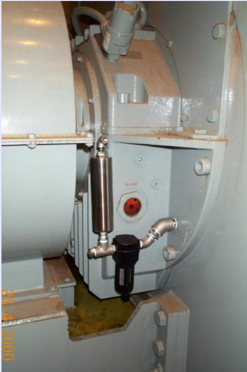
Image shows a small ozone destruct unit on a refiner electric motor. Each motor produces 19,000 Hp @ 12.8 kV. This voltage generates a tremendous amount of ozone which is quickly destroyed with the destruct unit.