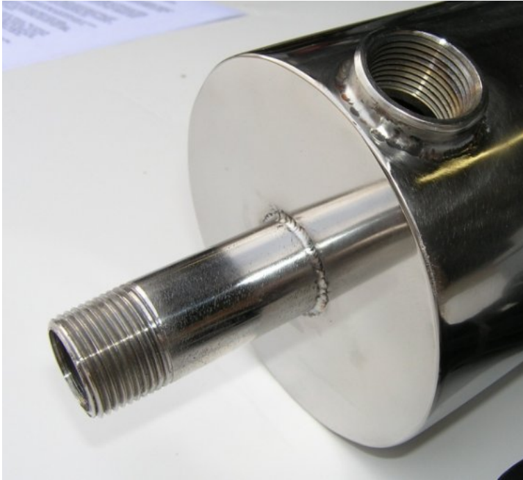
Image shows the 3/4-in MNPT ozone inlet & 3/4-in FNPT oxygen outlet. Unit is self-supporting when connected via the 3/4-in MPT inlet to your water tank.