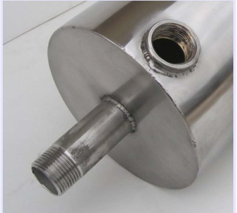
Image shows the 1-in MNPT ozone inlet & 1-in FNPT oxygen outlet. Unit is self-supporting when connected via the 1-in MPT inlet to your water tank.