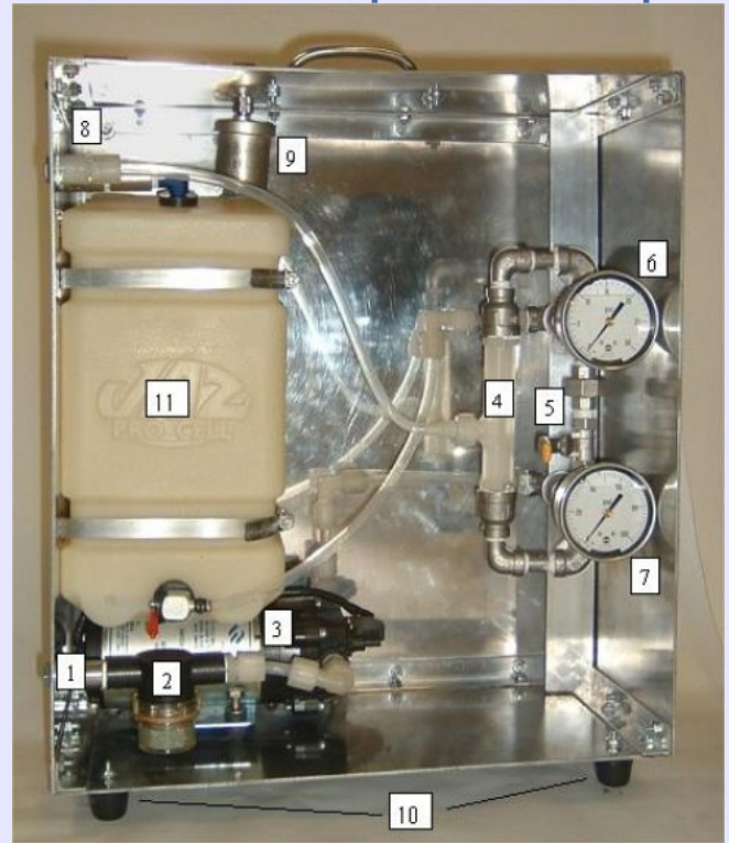
(1) Water Inlet, (2) 40 mesh filter, (3) 1.1 GPM pump, (4) Kynar Injector, (5) Injector bypass valve, (6) Outlet pressure gauge, (7) Inlet pressure gauge, (8) Ozone gas inlet, (9) Air/ozone vent, (10) Mounting feet, (11) 1-gallon contact tank